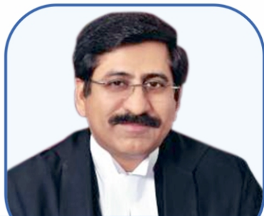
Chief Guest Hon'ble Shri Justice Sanjeev Sachdeva, Acting Chief Justice, High Court of Madhya Pradesh