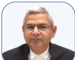
Hon'ble Shri Justice Vishal Dhagat Judge High Court of M.P.